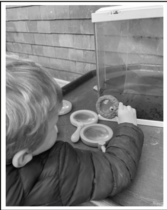
Observing the tadpoles.

Springtime is all about new life and we have certainly been lucky enough over the past month to have witnessed first-hand plenty of new life at pre-school. We have been looking at lifecycles with the children, observing and talking about the changes over time. We started with tadpoles and watched them turn into froglets before taking them back to their original habitat. We also had some caterpillars, which turned into beautiful Painted Lady butterflies. There is no better way than to learn about lifecycles than to experience these at first-hand. The children have learnt so much by observing and talking about the changes that they saw.