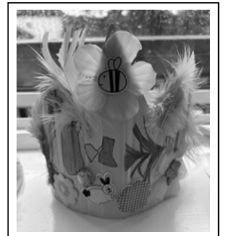
One of the amazing homemade Easter bonnet creations.

Are you entitled to 2-year funding? Some 2-year-olds in England can get free early education and childcare. Check to see if you are eligible by clicking on https://www.gov.uk/free-early-education If eligible, you can start claiming after your child turns 2. Places are subject to availability, please call 01428 652579 or email pre-school@fernhurst.w-sussex.sch.uk if you fit the criteria