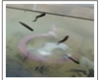
Some of the tadpoles.

We have also been busy celebrating Easter. Parents joined us at pre-school to enjoy listening to the spring and Easter songs that the children learnt and to watch the Easter Bonnet parade, there were some amazing creations and homemade bonnets on show. We also had an Easter egg hunt around the pre-school garden and made lots of Easter crafts.